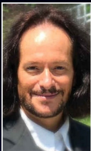
Organized by Ananda BOSMAN